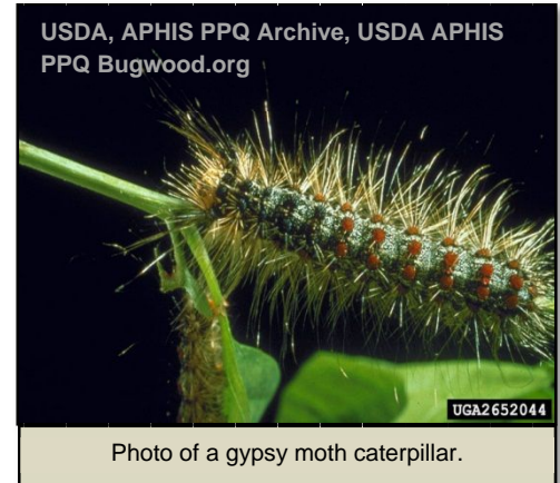
Photo of a gypsy moth caterpillar.

The caterpillars have a yellowish head capsule and a hairy charcoal grey body with 4 to 5 pairs of blue dots and 5 to 6 pairs of red dots along their backs. As the larvae mature the dots on their back may become darker in color and the body may grow up to 2 ½ inches in length. The fine hairs that cover gypsy moth eggs, caterpillar and pupae can cause skin irritation and rashes. The female gypsy moths are white in color with dark zigzag markings on their wings and have a wingspan of up to 3 inches. Although the females have wings, they are flightless. Male gypsy moths are smaller, brownish in color and have a wingspan of about 1 ½ inches.